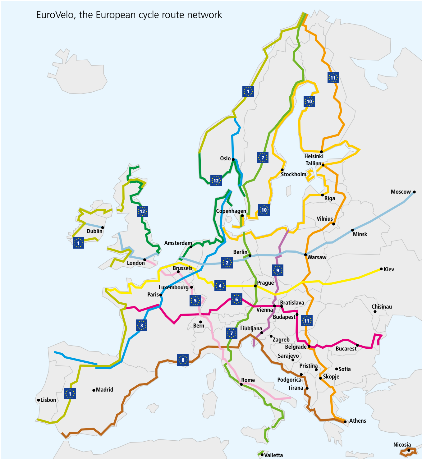
EuroVelo, the European cycle route network